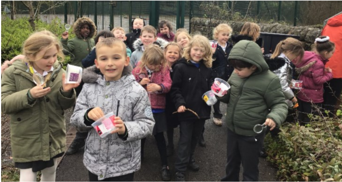
Year 1 on a mini-beast hunt, as part of their Science topic this term.